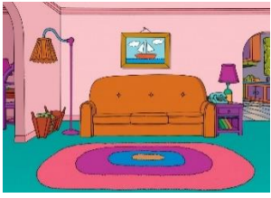
L I V I N G R O O M

A) Look at the pictures and choose the correct option.