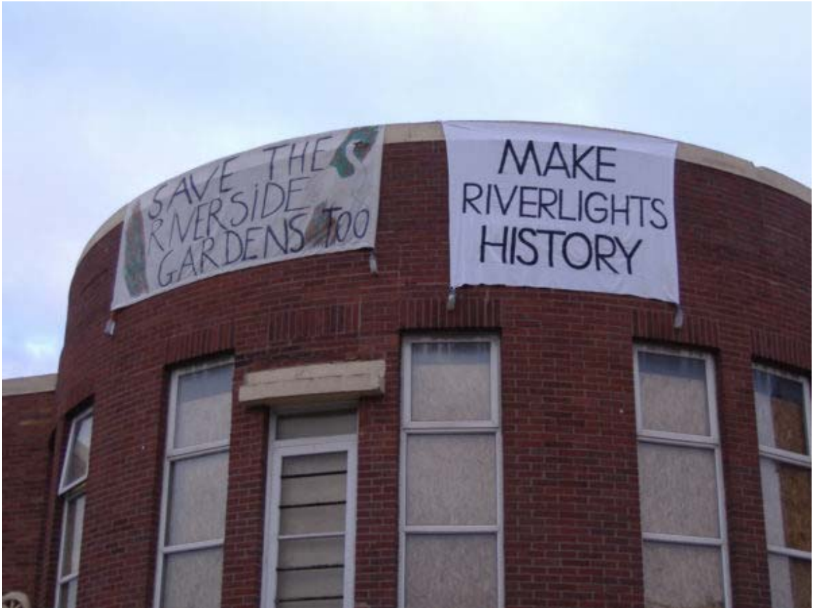
The protestors set out their stall.

The Battle for Derby Bus Station (article from 30.01.06)