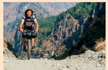
3 A man _____ in _____.