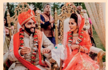
5 A man and a woman _____.