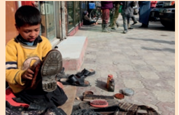
2 A small boy _____.