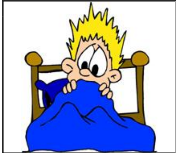
Student Relaxing in Mental Hospital

_____ says that he/she entered the mental hospital because _____ _____ _____