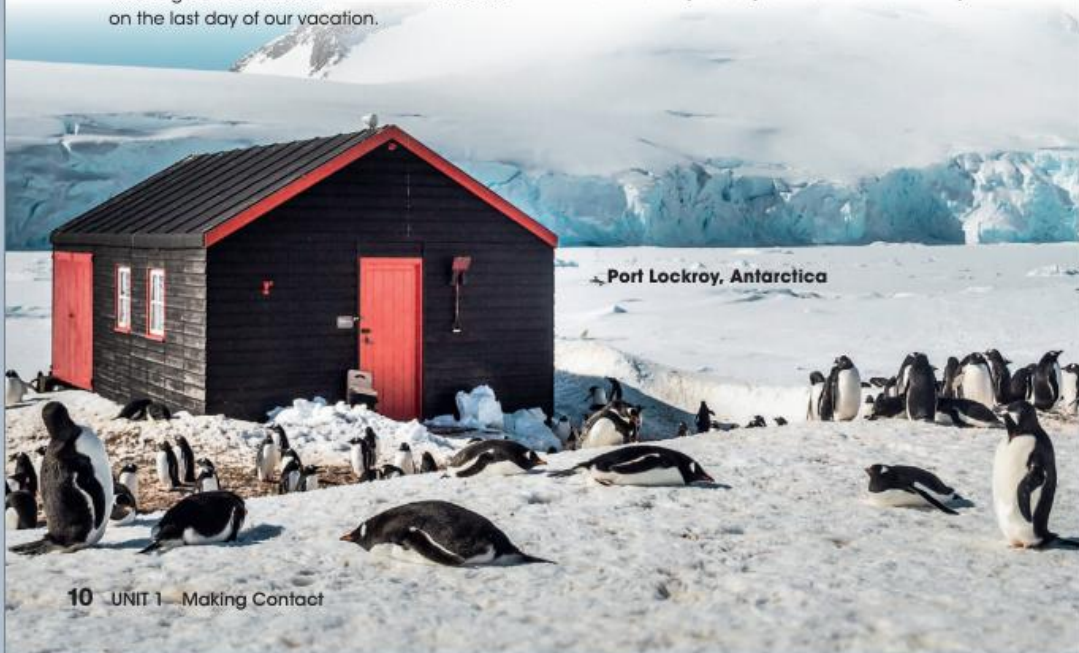
Port Lockroy, Antarctica

4 Work in pairs. Discuss. Which post office from Activity 3 do you want to visit? Why?