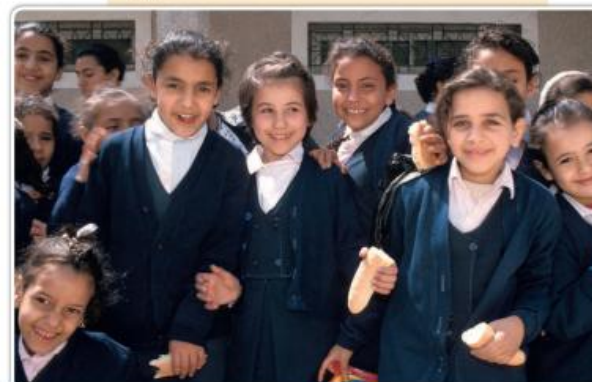
Schoolchildren in Egypt