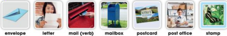
envelope letter mail (verb) mailbox postcard post office stamp

2 Complete the text with words from Activity 1. There are two words you don't need.