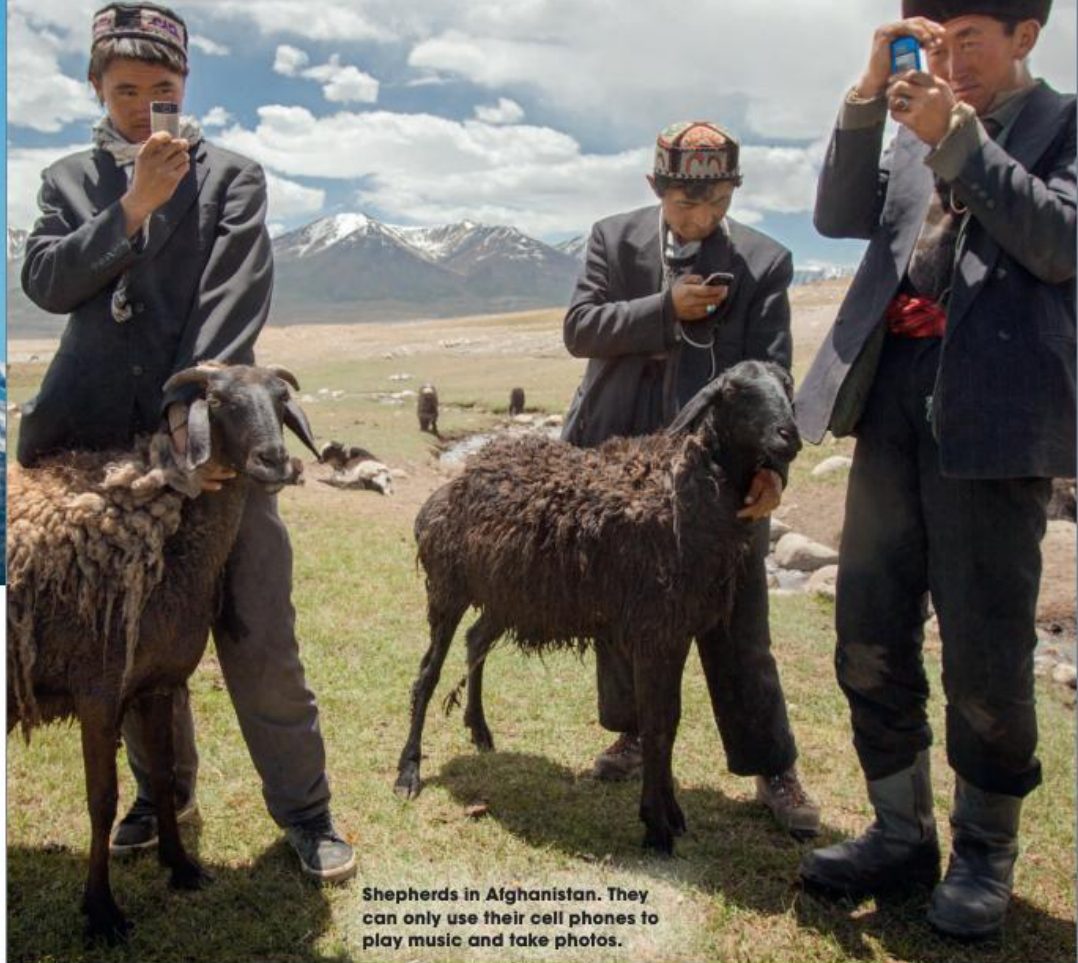
Shepherds in Afghanistan. They can only use their cell phones to play music and take photos.

Look at the photo. Discuss the questions.