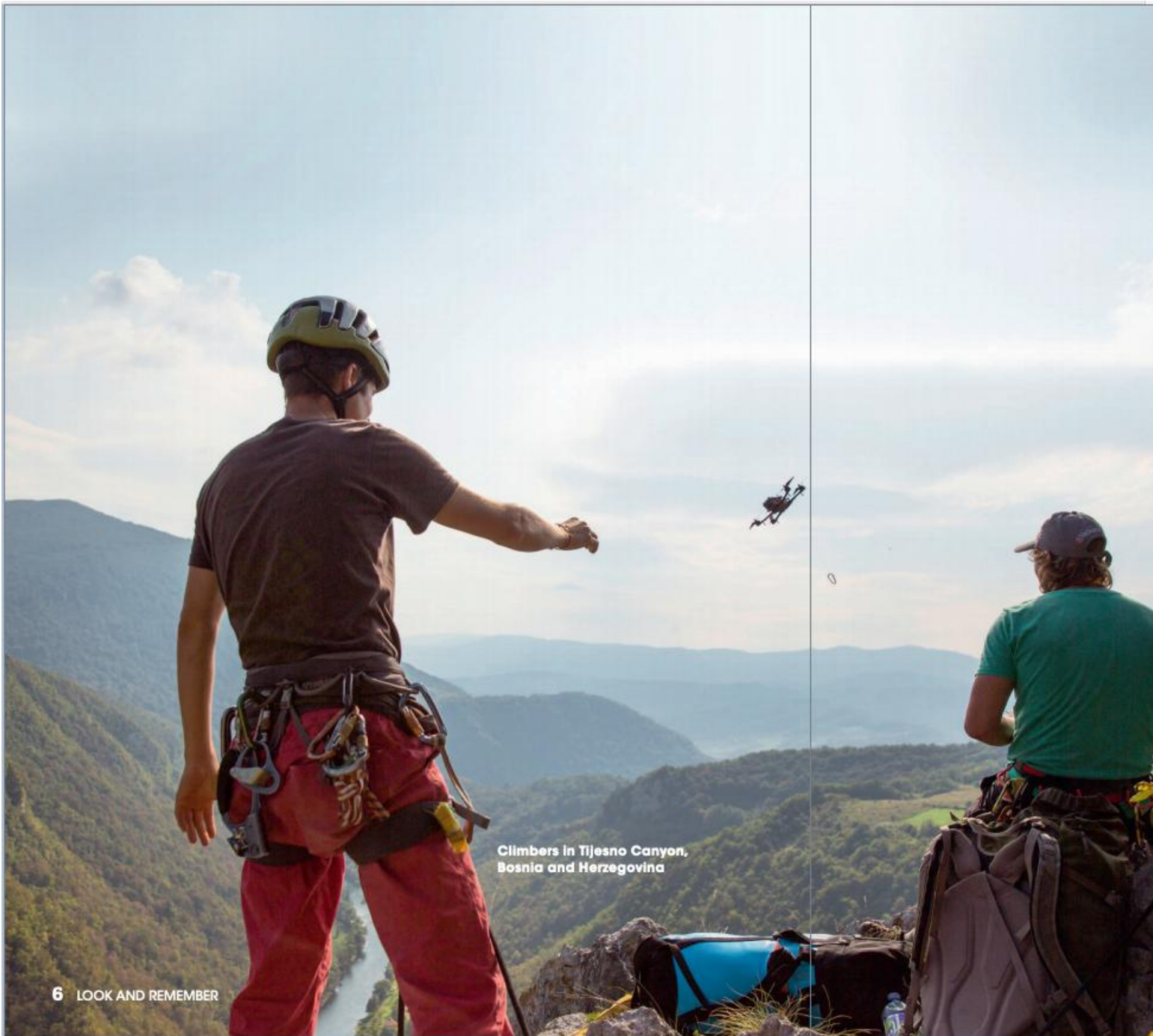
Climbers in Tjesno Canyon, Bosnia and Herzegovina