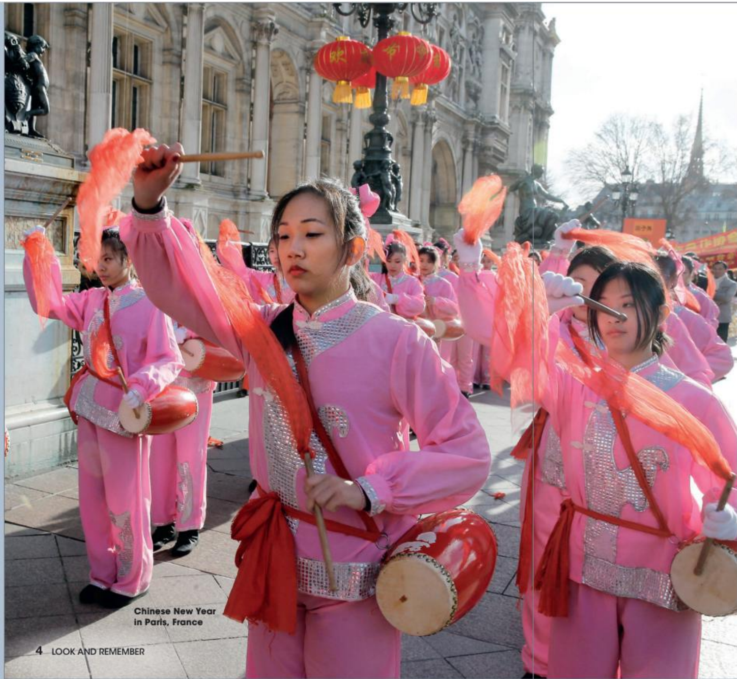
Chinese New Year in Paris, France