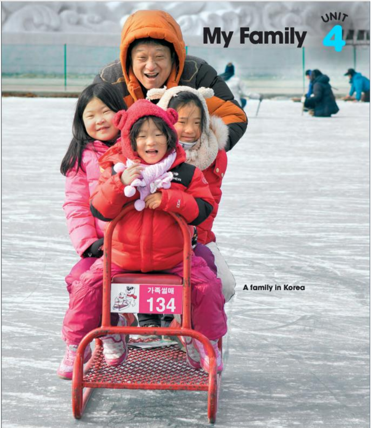
A family in Korea