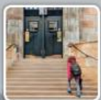
get to school