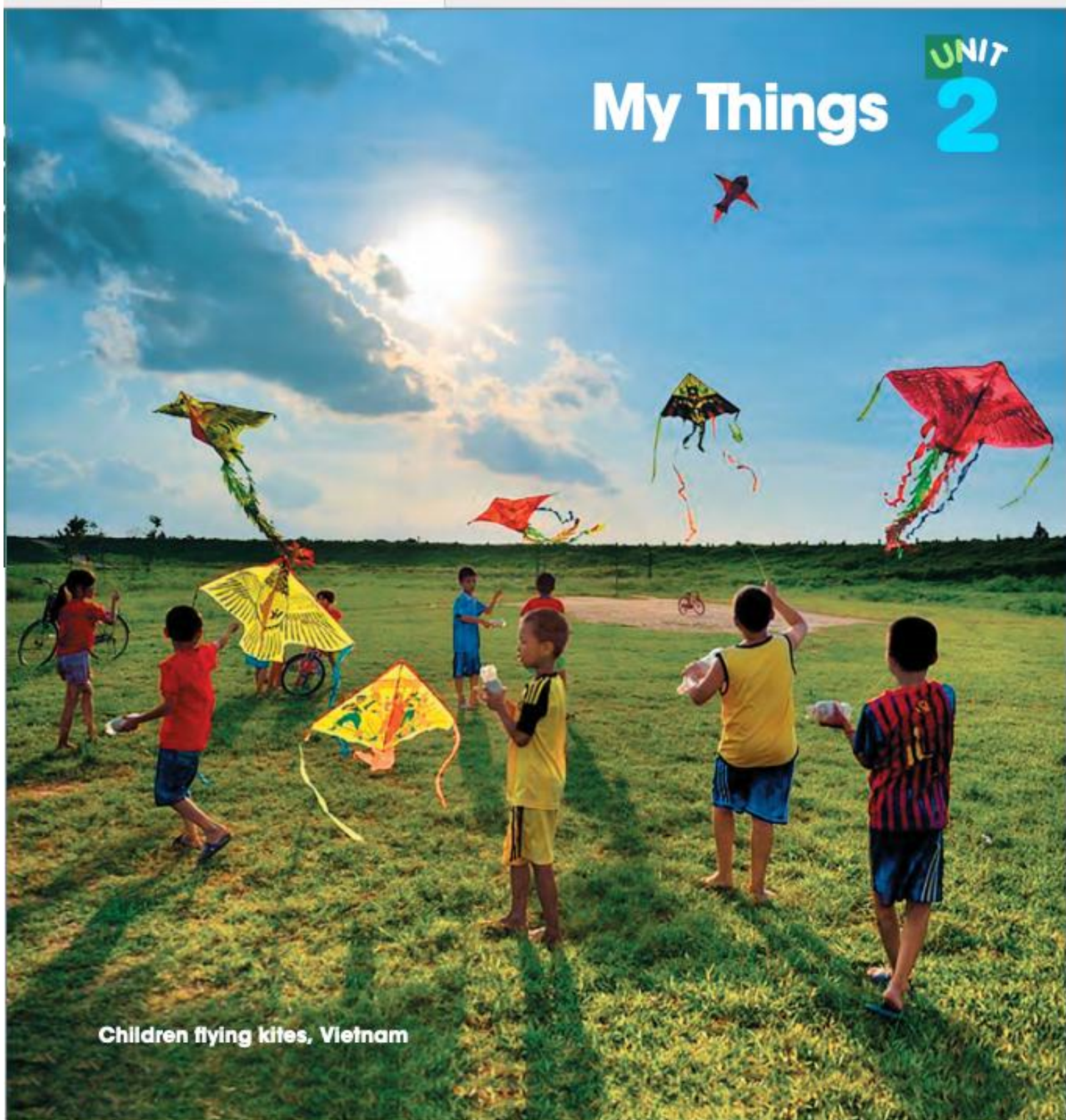
Children flying kites, Vietnam

Look at the photo. Answer the questions.