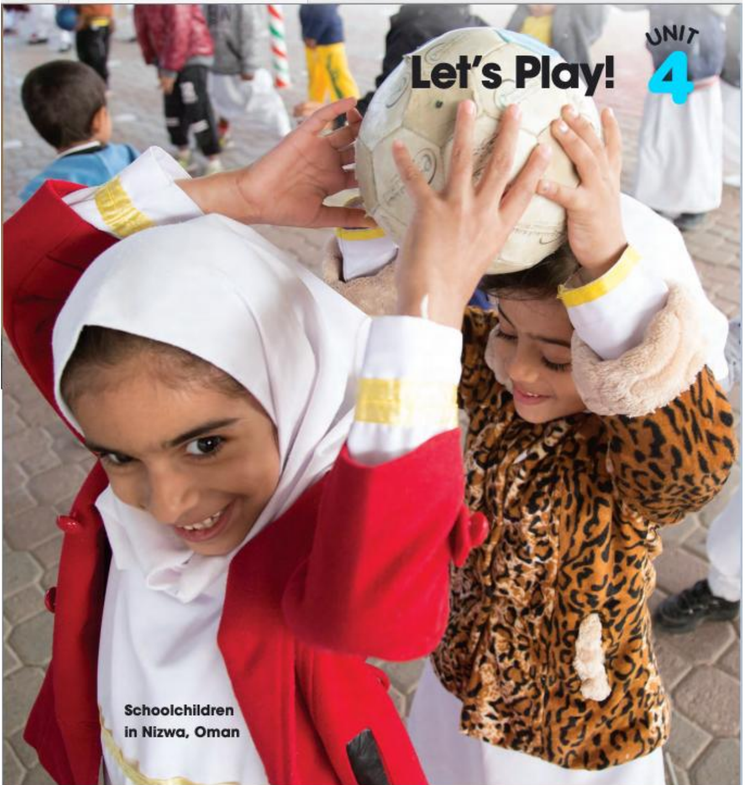
Schoolchildren in Nizwa, Oman

Look at the photo. Answer the questions.