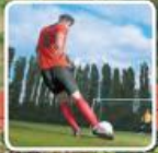
soccer player score goals