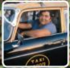
taxi driver drive