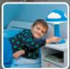
go to bed