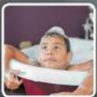
take a bath