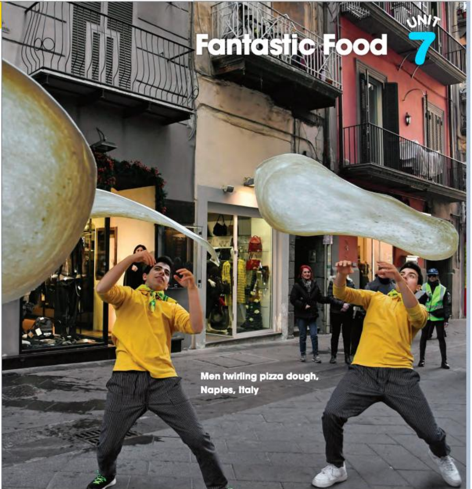
Men twirling pizza dough, Naples, Italy

Look at the photo. Answer the questions.