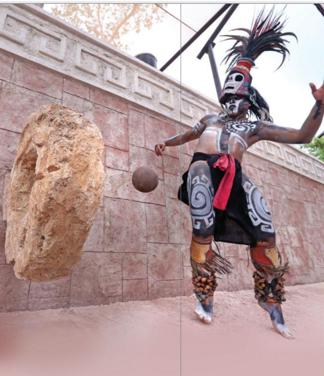
A Maya ball game