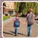
walk to school