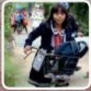
bike to school