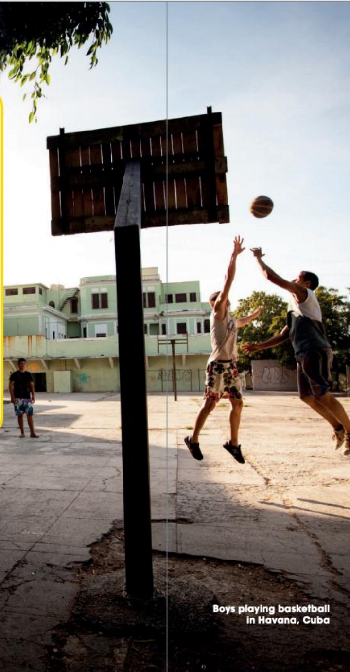
Boys playing basketball in Havana, Cuba

VALUE Be interested in others. Workbook, Lesson 6