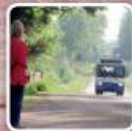
wait for the bus