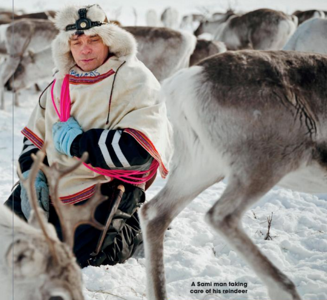
A Sami man taking care of his reindeer

3 PROJECT Draw a map of an imaginary place. What animals live there? Choose a place to live.