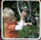
fix my bike