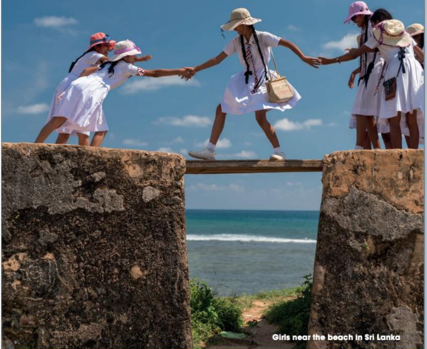
Girls near the beach in Sri Lanka

Look at the photo. Answer the questions.