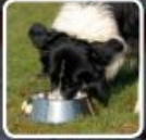
feed the dog