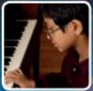
practice the piano