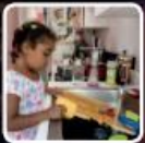
wash the dishes