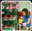
water the plants