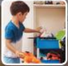
clean up my bedroom