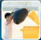
take out the garbage