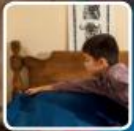
make my bed