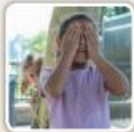
play hide- and-seek