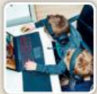
play video games