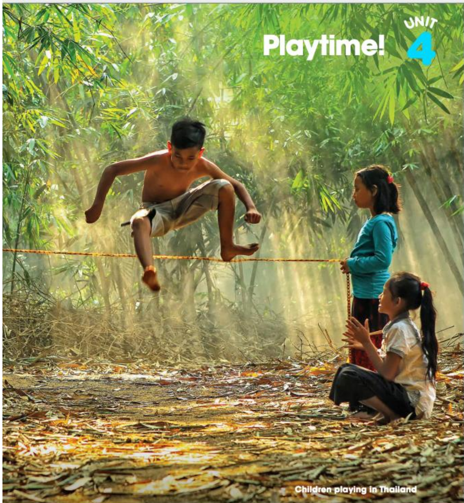
Children playing in Thailand

Look at the photo. Answer the questions.