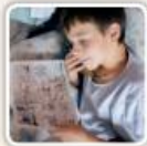
read comic books