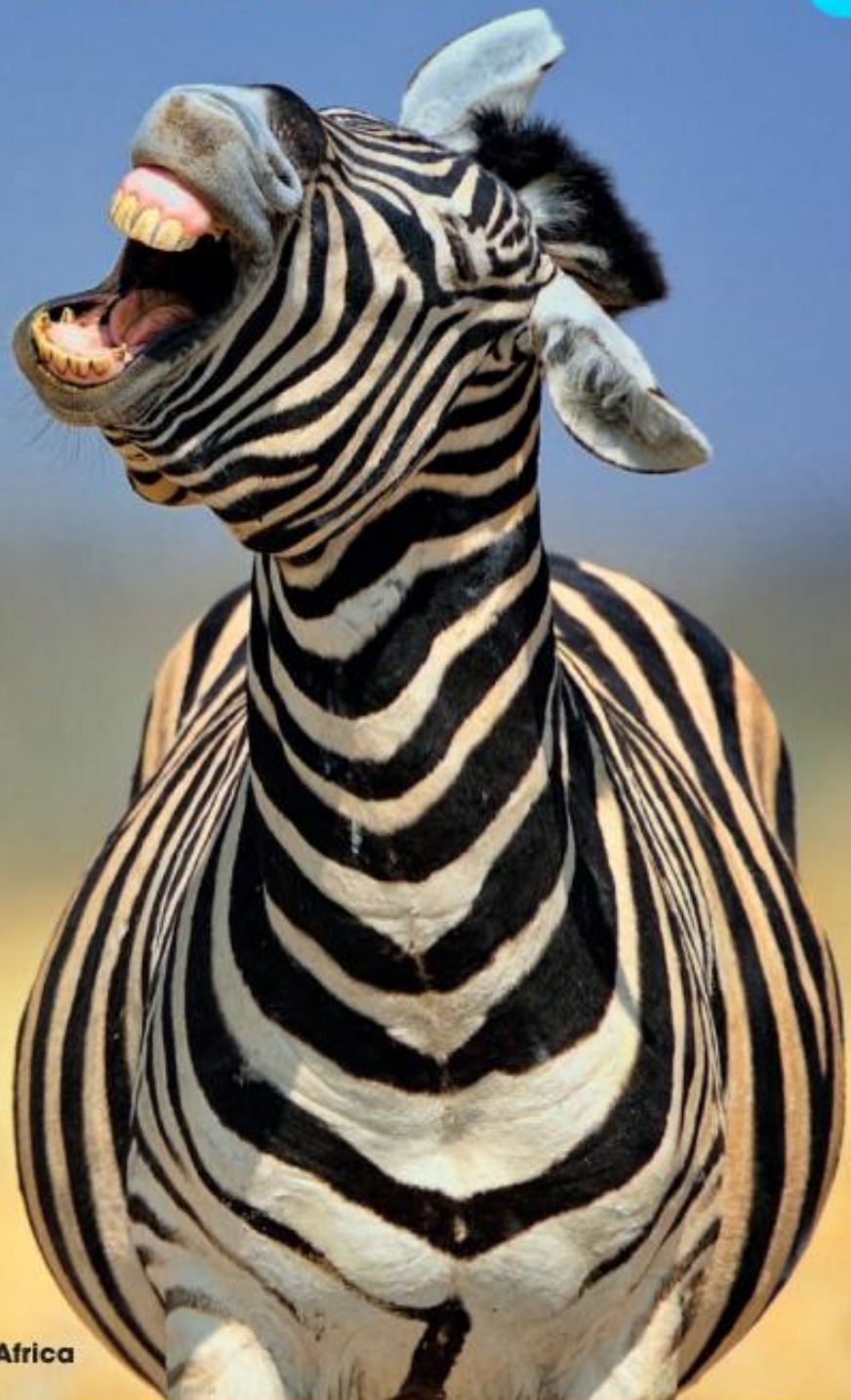
A zebra in Africa

Look at the photo. Answer the questions.