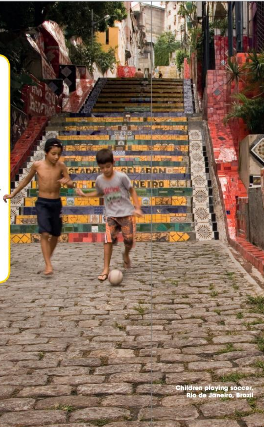
Children playing soccer, Rio de Janeiro, Brazil

VALUE Love your town. Workbook, Lesson 6