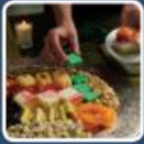
eat traditional food