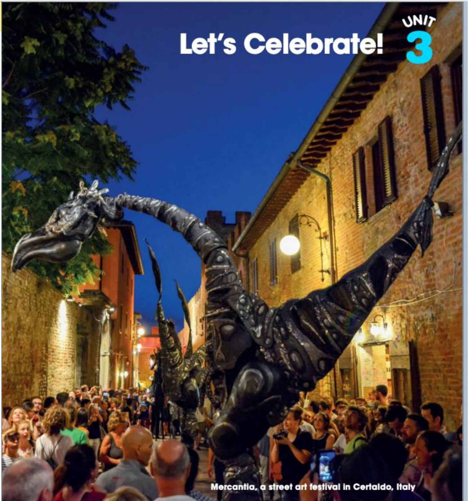
Mercantia, a street art festival in Certaldo, Italy

Look at the photo. Answer the questions.