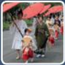
watch a parade