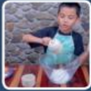
make special food