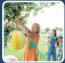
put up decorations