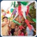
play party games