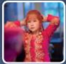
wear traditional clothes