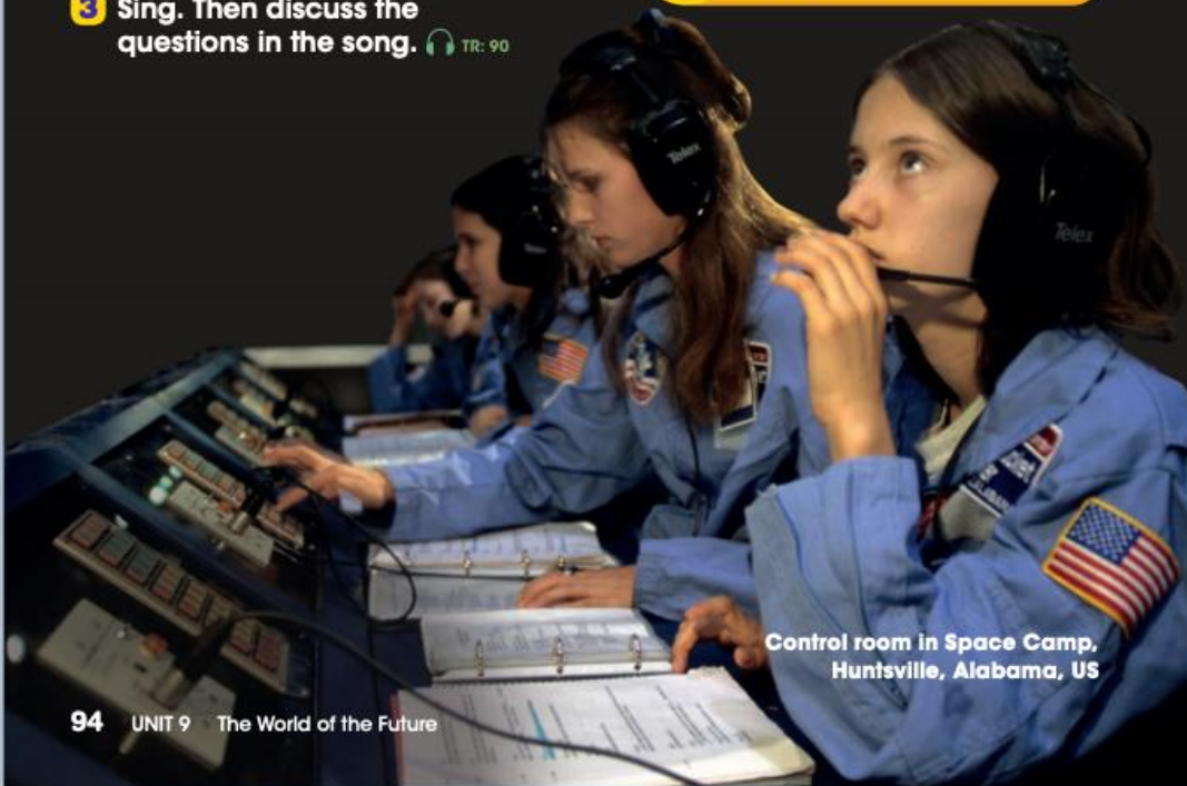
Control room in Space Camp, Huntsville, Alabama, US

VALUE Use your imagination. Workbook, Lesson 6