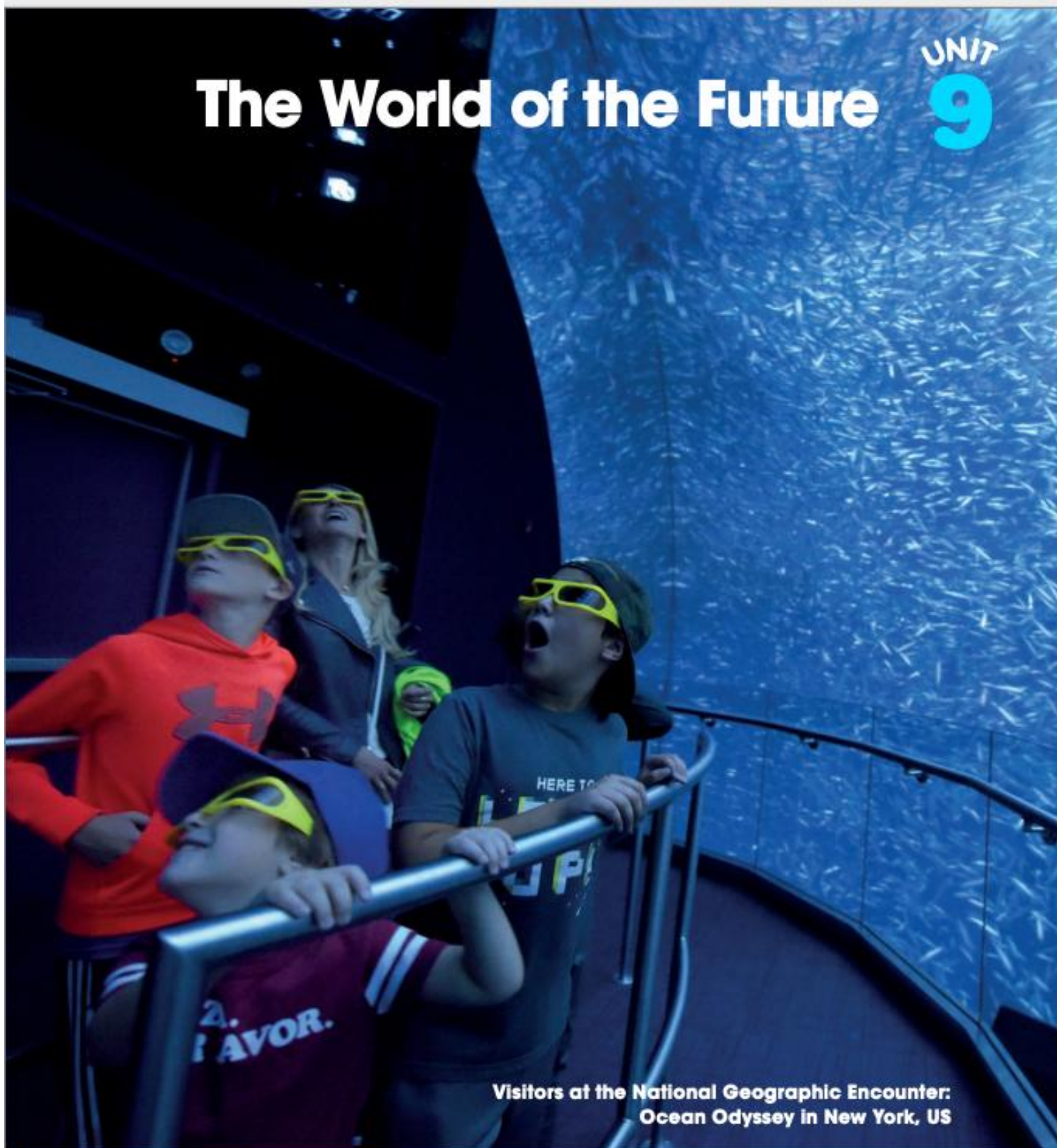
Visitors at the National Geographic Encounter: Ocean Odyssey in New York, US

Look at the photo. Answer the questions.