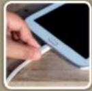
charge a tablet