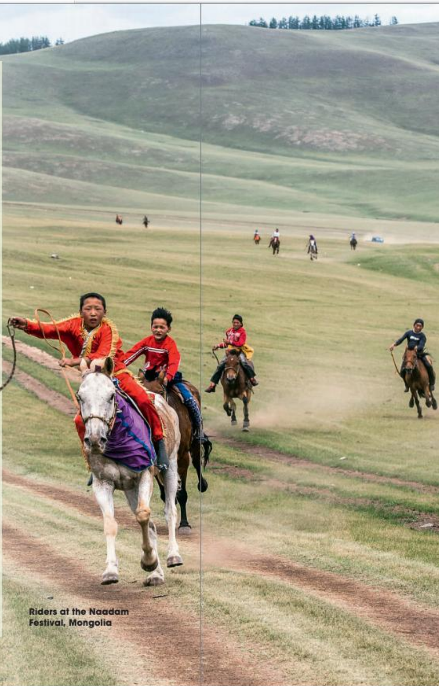
Riders at the Naadam Festival, Mongolia