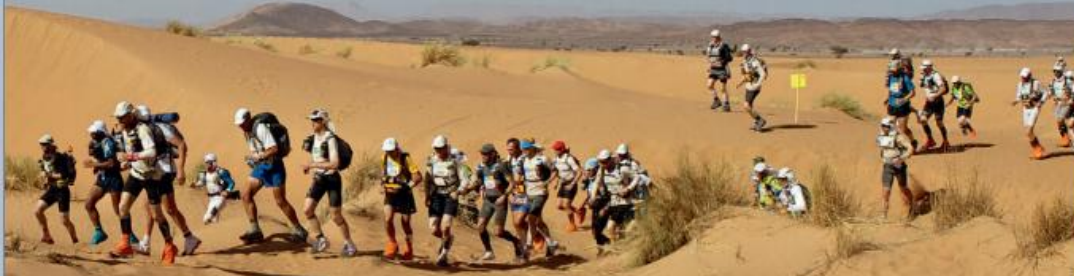
The Sahara Desert, Morocco

burning very, very hot fifty degrees below -50° Celsius rainforest a forest in a tropical place where it rains a lot