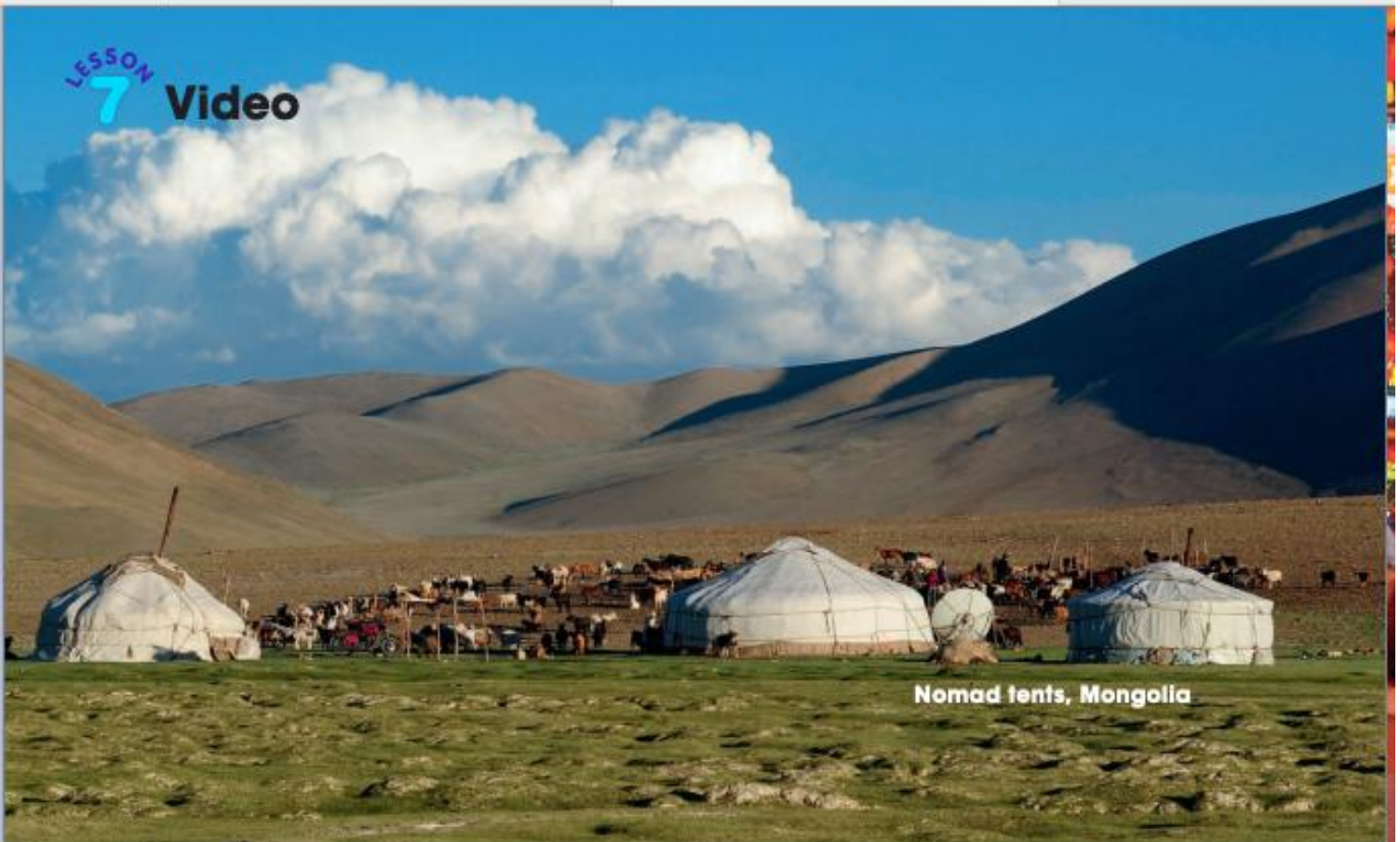
Nomad tents, Mongolia