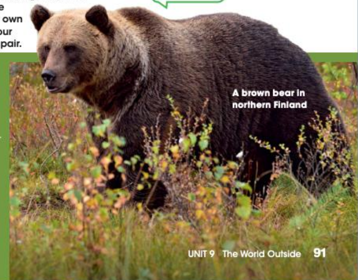
A brown bear in northern Finland