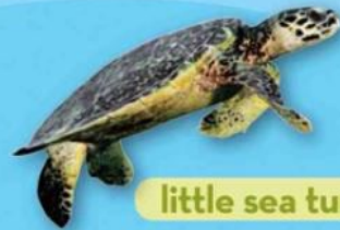
little sea turtle