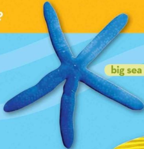
big sea star