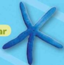
little sea star