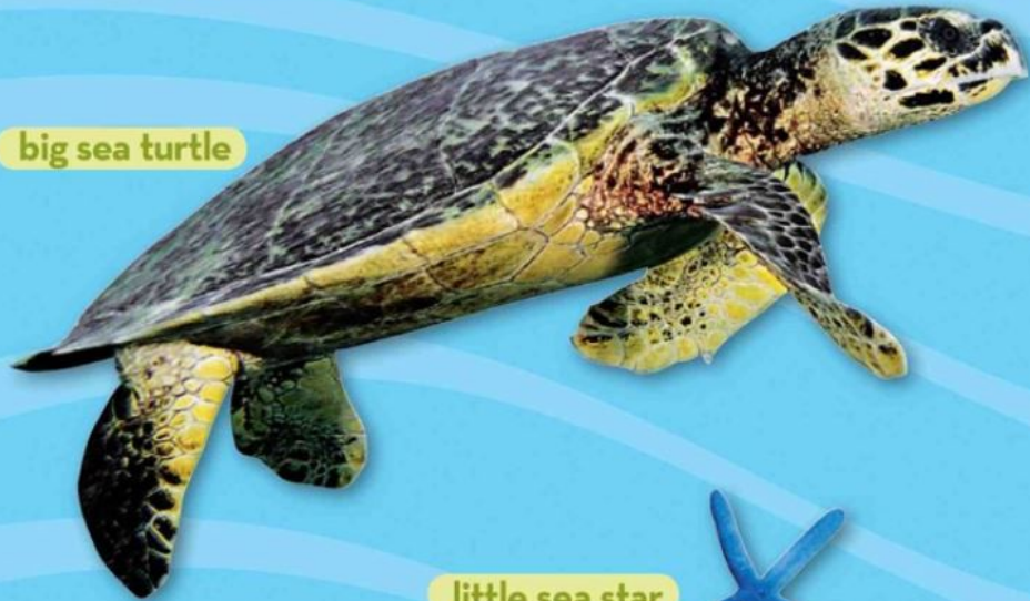
big sea turtle