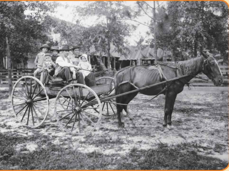
(big) Nic Taylor/Photodisc/Getty Images, (c) Jupiterimages/Comstock Images/Getty Images

Long ago, it was hard to get to school. Boys and girls walked far. Some used horses.