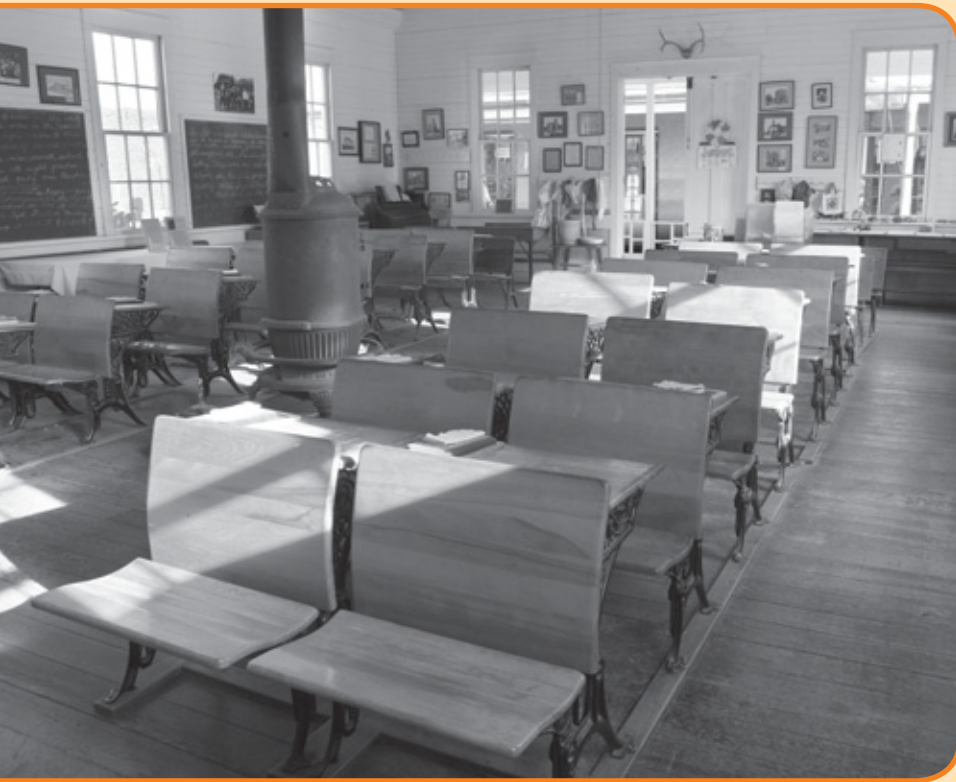
(bkgel) Nic Taylor/Photodisc/Getty Images, (c) Ellen Isaacs/Alamy

Long ago, a stove made a classroom warm. The light came from outside.