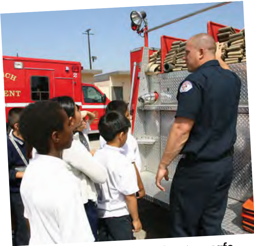
Firefighters help people stay safe.

They teach me what to do if there is a fire. They say to go outside and then call 9-1-1.