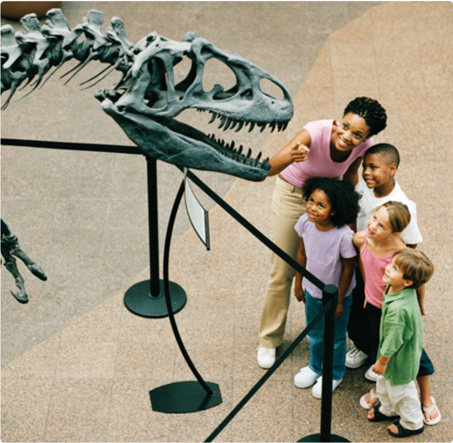
People in cities can visit museums to learn about art, history, or even dinosaurs.

Museums are another great place to visit in the city. A museum worker gave this family a map to find their way around and see interesting displays. The family looks forward to exploring different exhibits and stopping at the gift shop. Maybe they will even see an exciting 3-D movie about dinosaurs or pyramids.