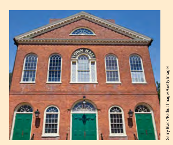
Mayors work in the Town Hall or council buildings.

for bringing new jobs to the community. They make sure that local businesses follow health, safety, and environmental rules. Mayors and councils also work with the state government to meet the needs of local areas.