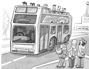
take a bus tour/ in London