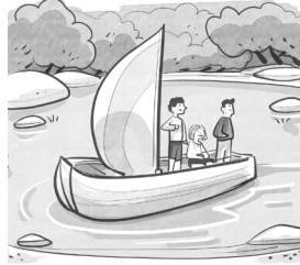
go sailing/ on a lake