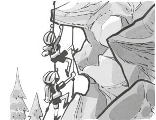
go climbing/ in the mountains