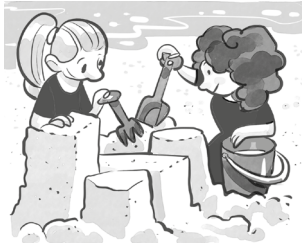
build a sandcastle/ at the beach