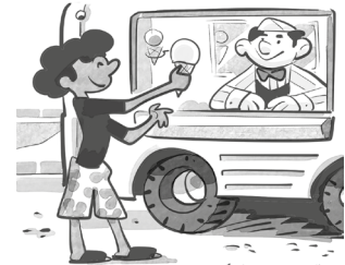
buy an ice cream/ at the beach