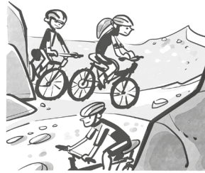
go mountain biking/ in the mountains