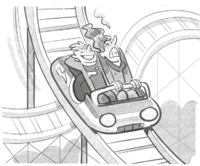
visit a theme park/ in Madrid