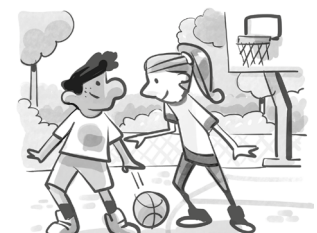
play basketball/ at a park