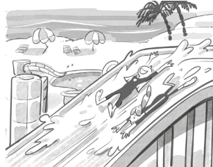
visit a waterpark/ at the seaside