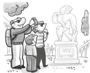
go sightseeing/ in Italy