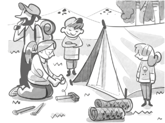
go camping/ at a campsite