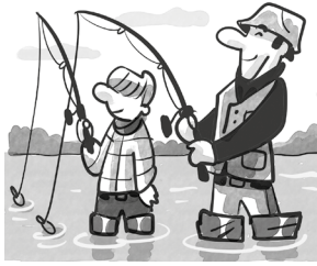
go fishing/ in a river