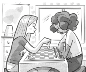
play chess/ at home