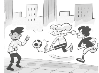
play football/ in a city