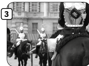
The soldiers and horses