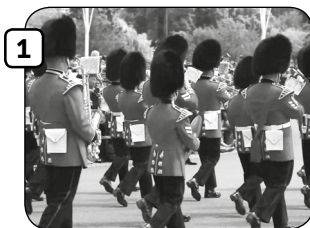
The soldiers are playing music

guard the Tower of London stand very still play music ride to the palace