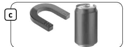
The magnet doesn't attract this metal can.