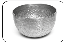
5 silver bowl