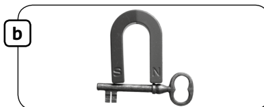
The magnet attracts this metal key.