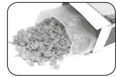
3 cereal box