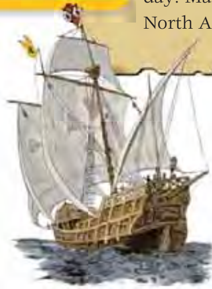
The Santa Maria , Columbus's flagship

The sixteenth century was a period of great exploration by European countries. Facing known and unknown dangers, explorers set sail in the best sea-going vessels of their day. Many of those explorers who set sail for North America were from Spain.