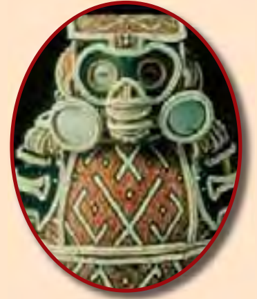
This carved figure represents a Taino idol or god.

Scientists and historians are documenting —making a record of—and studying the items from the well. After 500 years of silence, it seems that the story of the Taino will finally be told.