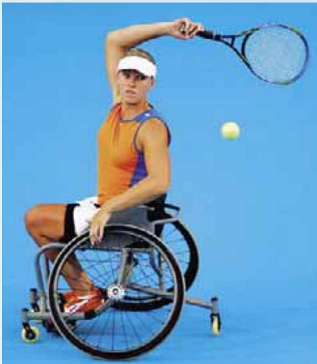
Tennis and running are both Paralympic events.

Athletes with disabilities compete in the Paralympics. The games are held every four years. They began in 1960. There were only a few athletes and a few kinds of games back then. Now many athletes from all over the world come together to compete in many kinds of games.