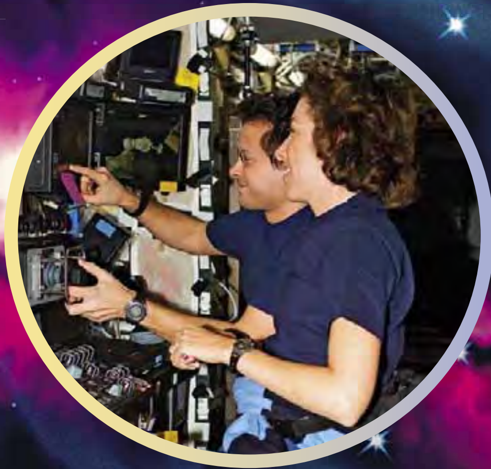
Ellen Ochoa works at the space station.

Answer: You have to learn a lot. And make sure you learn it before you leave Earth!