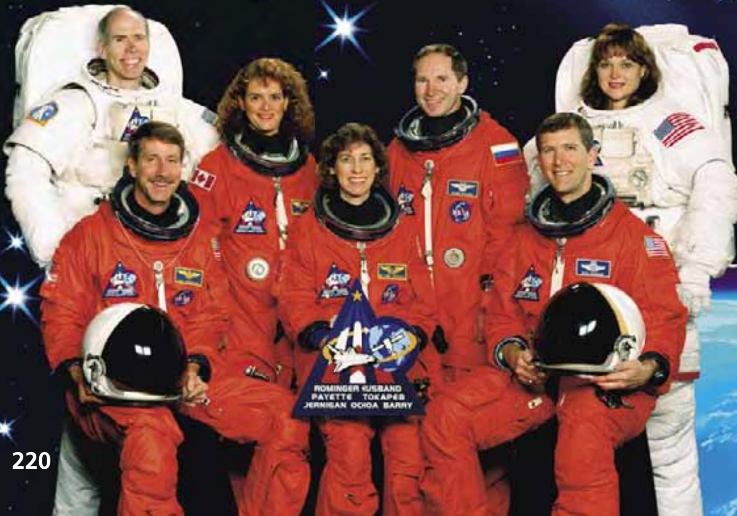
Ellen Ochoa with her team before going into space

Answer: They should study math and science and go to college. They should like learning new things and working in a team.