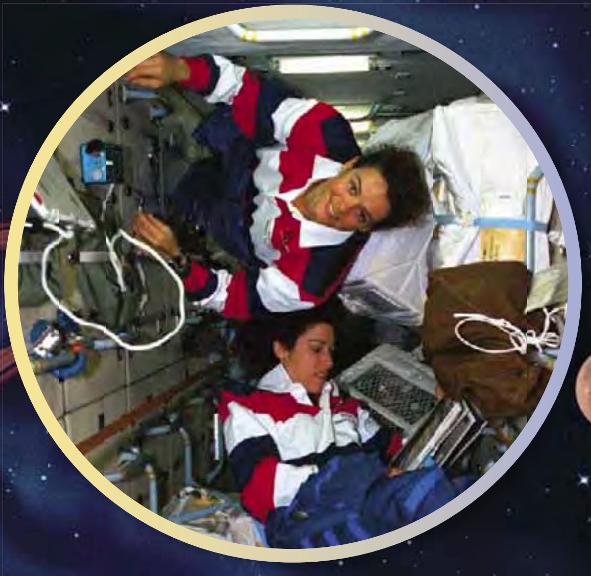
Ellen Ochoa inside a space module

Question: What's it like to be in space?