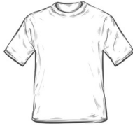
6) This T-shirt has lots of _____ and needs ironing.