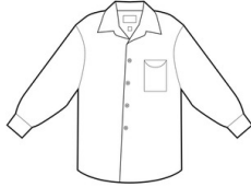
2) This shirt has four _____ .