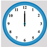
It's twelve o'clock.