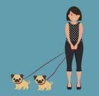
Your name is Emma. You do not have a job You walk your dogs in the park during the day. You sleep at night. You have two dogs called 'Bow' and 'Wow. You love your dogs.