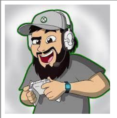
Your name is Pete. You do not have a job. You stay home all day. You stay up all night playing computer games. You are usually very bored. You do not want a job.

Your name is Jane. You are a doctor. You work at the hospital with John. You help sick people. You work at night. You are very friendly. You cannot answer questions about your work because it is illegal.